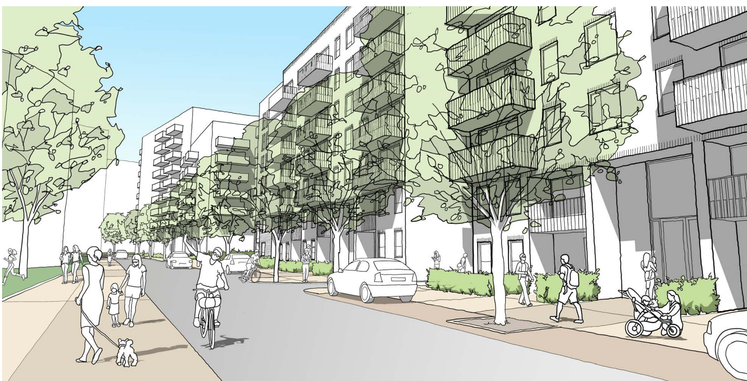
Above: the scheme frames the new north-south street (extension of Stafford Road) with active frontages and buildings of varying heights.