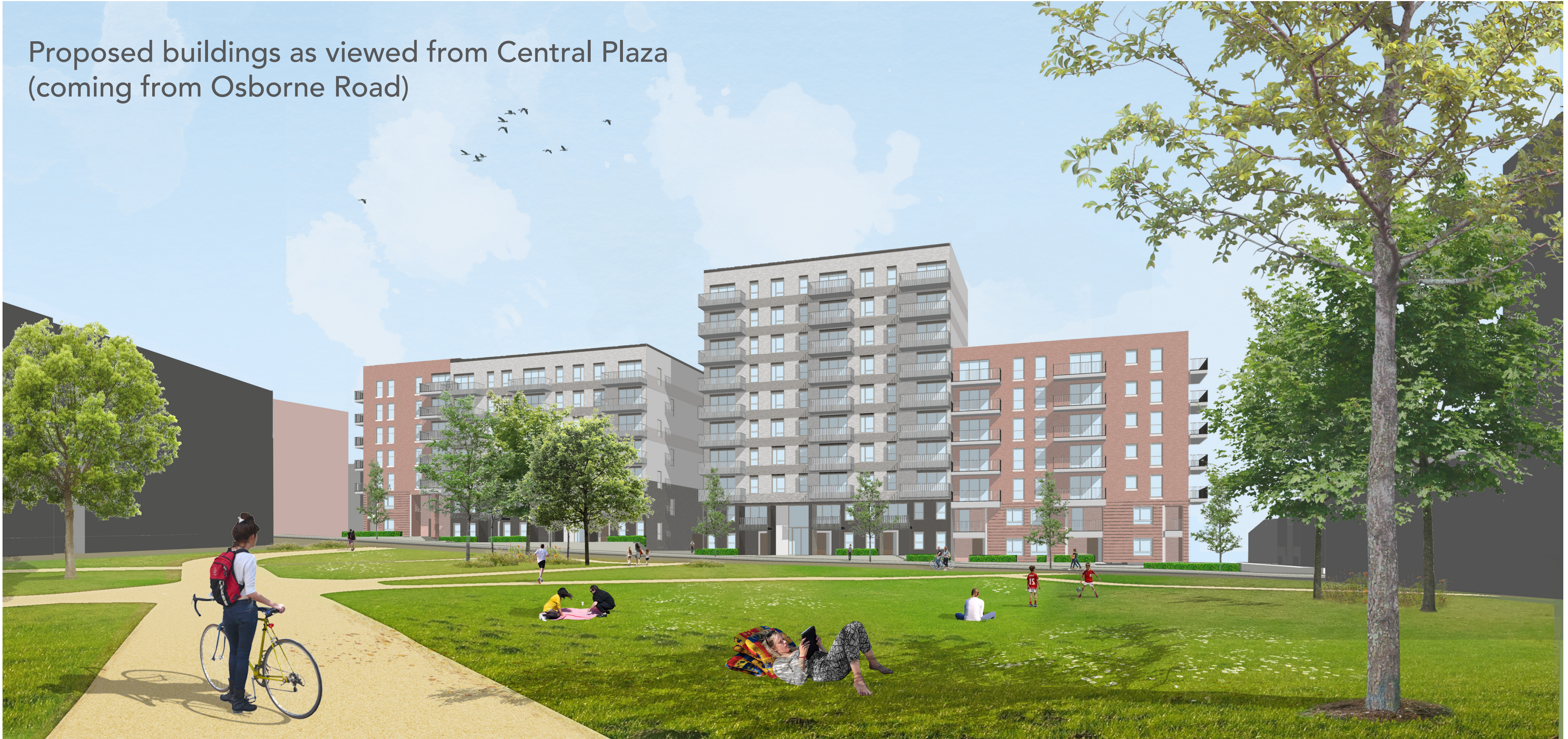
Proposed buildings as viewed from Central Plaza (coming from Osborne Road)

Our vision for this phase is for the new buildings and spaces to create a link between the recently opened Acton Gardens Community Centre (Phase 6) and the development of new homes in the north of the estate leading to Acton High Street (Phase 7.1). The design principles informing the evolving proposals include: