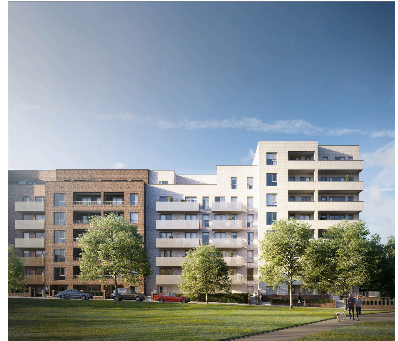
Visual of Phase 7.1