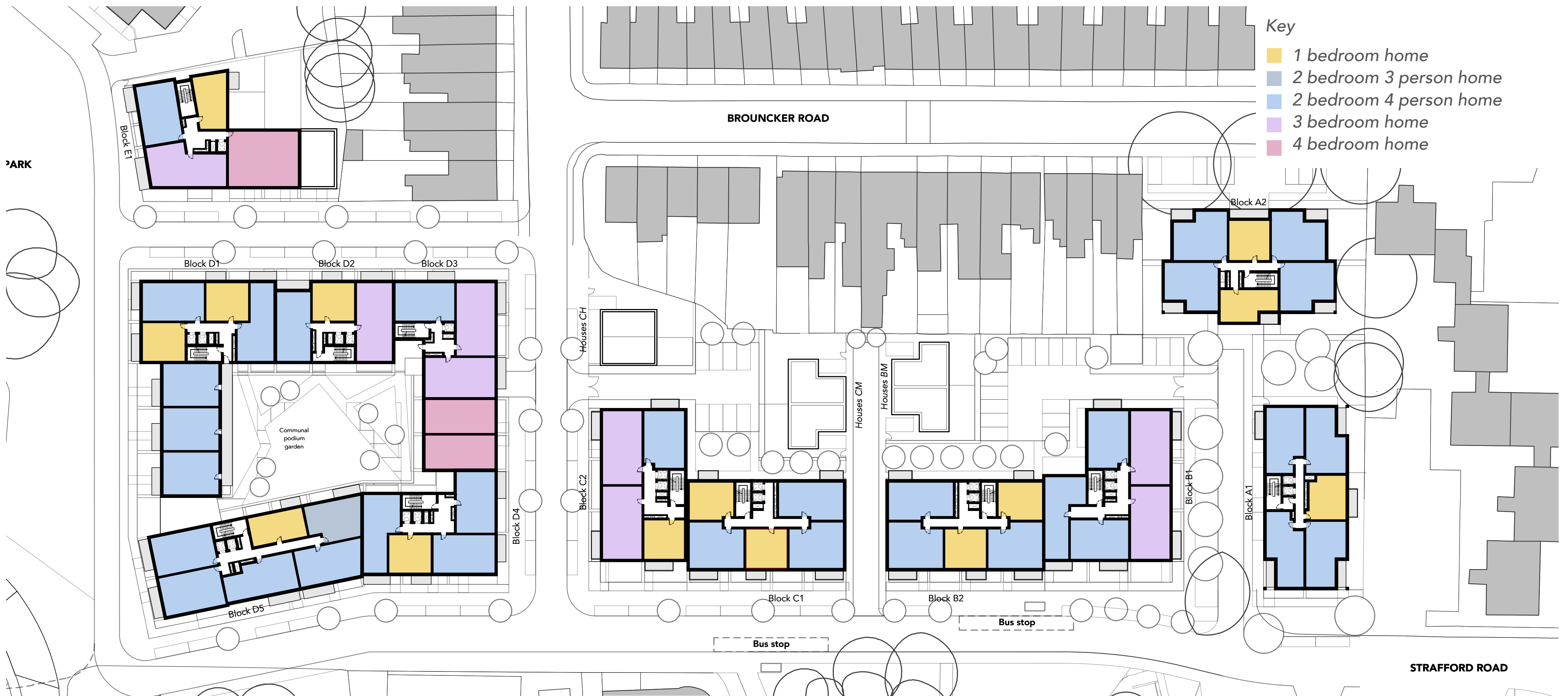
Above: Typical floor plan