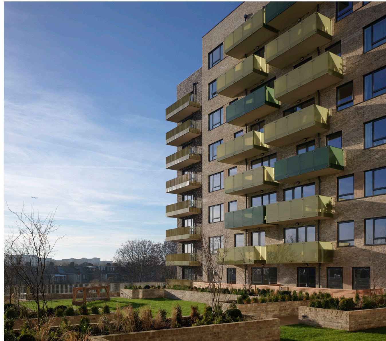
Phase 3.1 completed

The new homes will include a mix of 1,2,3 and 4 bedroom apartments and maisonettes.