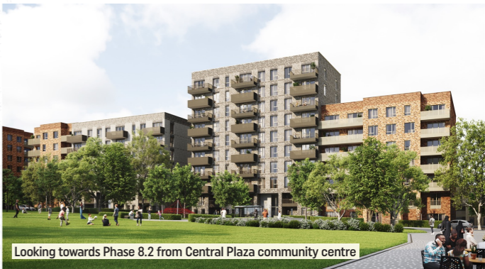
Looking towards Phase 8.2 from Central Plaza community centre