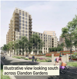
Illustrative view looking south across Clandon Gardens