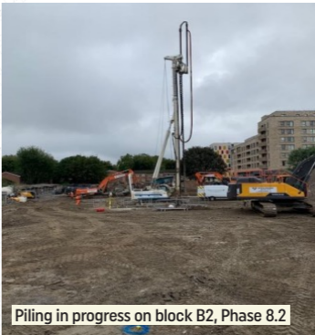
Piling in progress on block B2, Phase 8.2