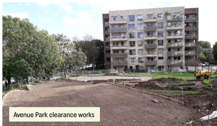
Avenue Park clearance works

The Phase 1 playground works at Avenue Road are complete, and an opening event will be held very soon. Phase 2 of the park will come forward with later phases at Acton Gardens when the new road connecting Trafford Road to Avenue Park road is completed.