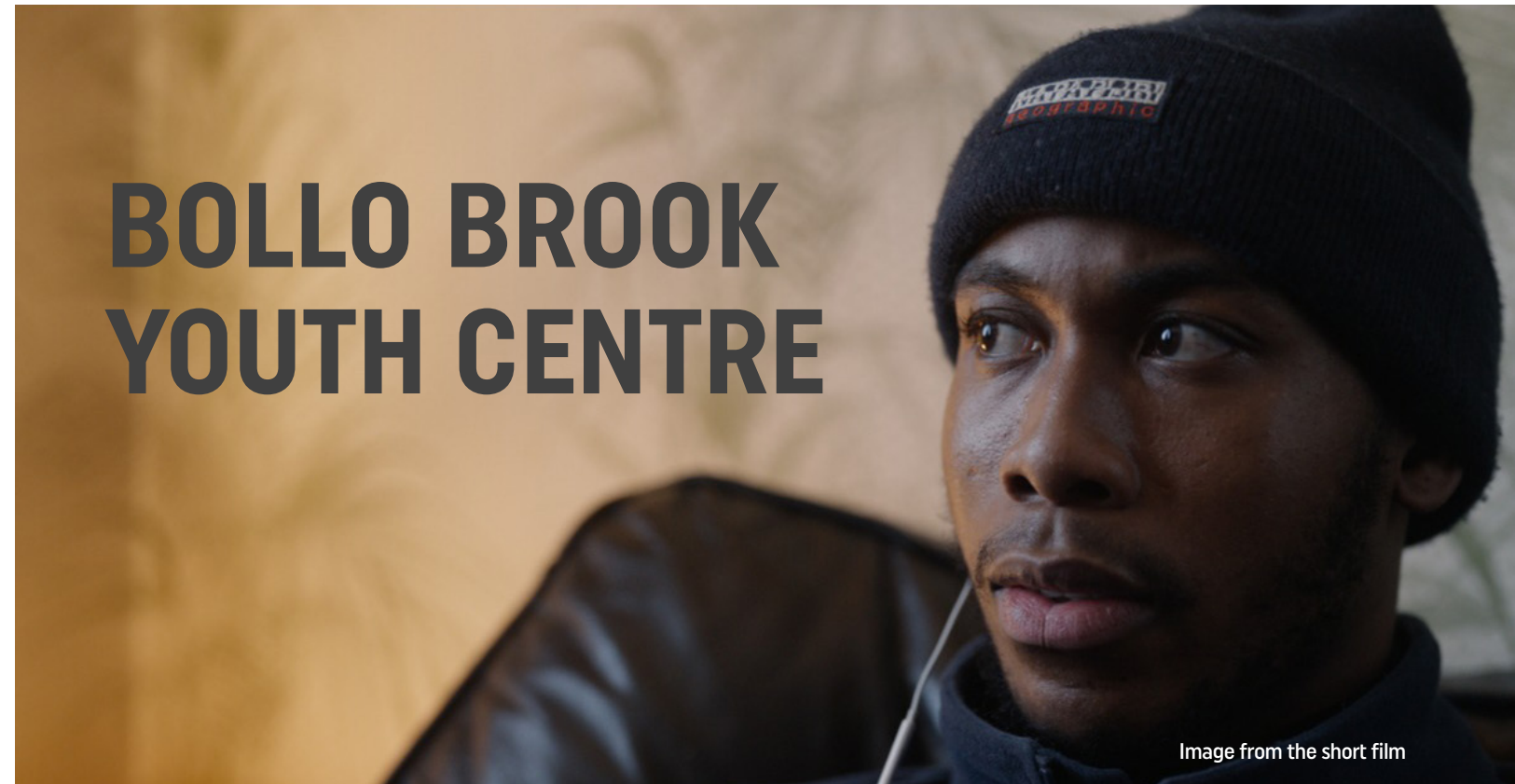
Image from the short film

With the lifting of restrictions, Bollo Brook Youth Centre has been able to reopen three days a week for limited numbers of young people. It has been great to have groups back in again, with a range of activities, including music, dance, and art, as well as continuing with food distribution for local families and sheltered housing residents.