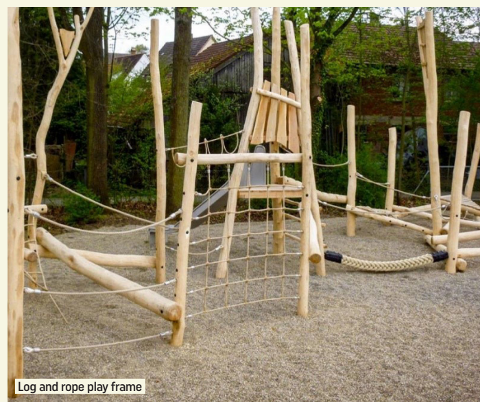
Log and rope play frame