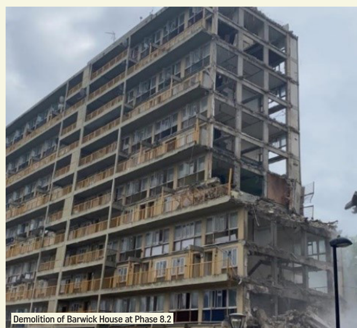
Demolition of Barwick House at Phase 8.2

Phase 8.1 will shortly follow Phase 8.2 and will provide a courtyard block style podium. Phase 8.1 is located on the site of Ludlow Court and Carisbrooke Court.