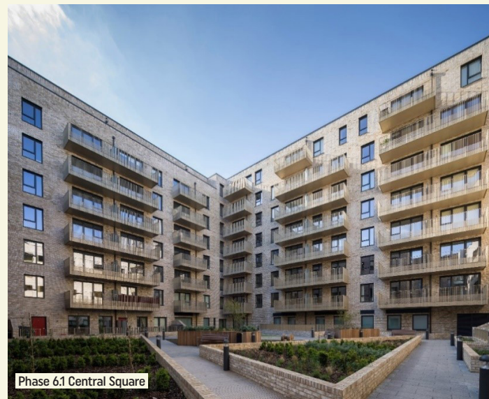
Phase 6.1 Central Square

Phase 8.2 is located to the east of Central Plaza on the site of Barwick House, Carisbrooke Court, the South Acton Working Men's Club and Brouncker Road. Phase 8.2 will begin construction of the new road which will eventually connect Stratford Road to Avenue Road. The South Acton Working Men's club has now been demolished and Barwick House is partially demolished.