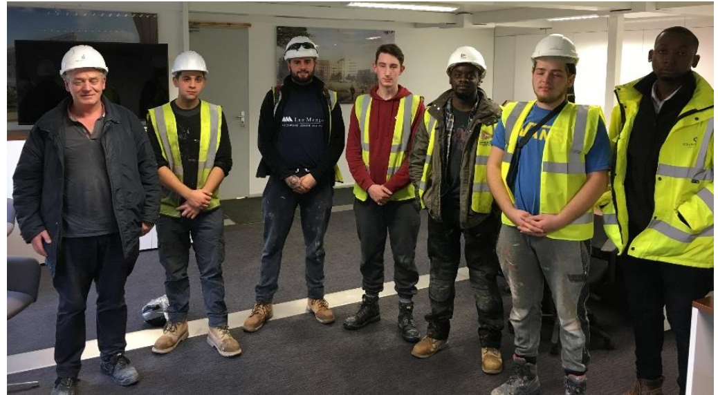
Phase 7.1 Apprentices

Calculated by postcode. Figures for 2019.