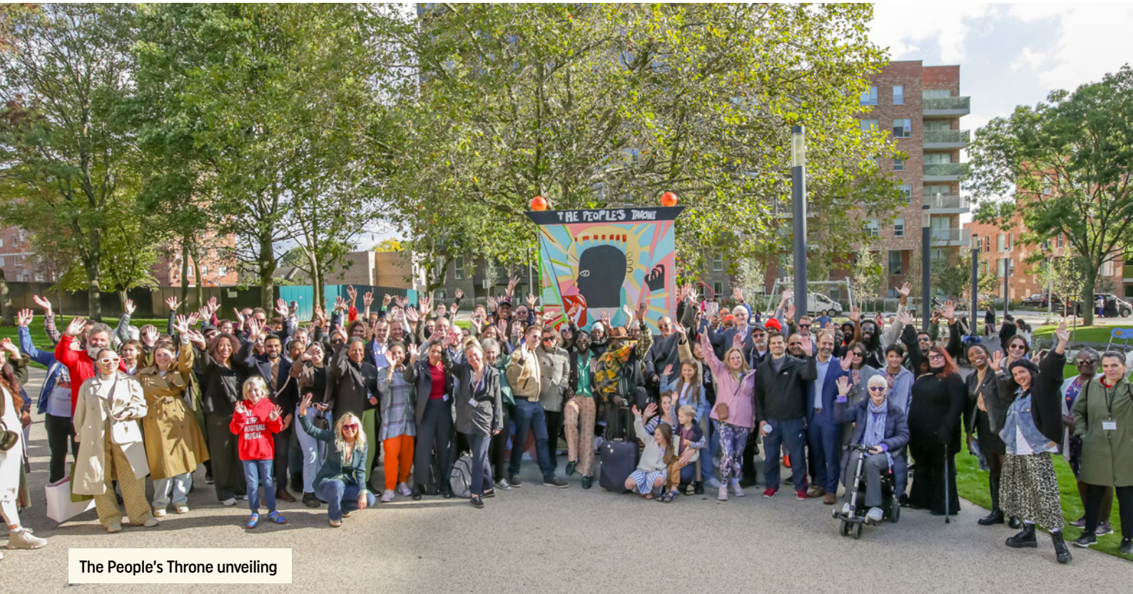
The People's Throne unveiling

Welcome to the 38th edition of the Acton Gardens newsletter. Here you'll find updates to keep you involved and informed throughout the regeneration of South Acton.