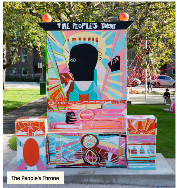
The People's Throne

The opening of Central Plaza opening took place on Saturday 14 October 2023 at Acton Gardens.