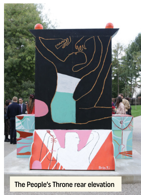
The People's Throne rear elevation

@ If anyone has any feedback or ideas for a community event please do not hesitate to contact us at y@lqgroup.org.uk