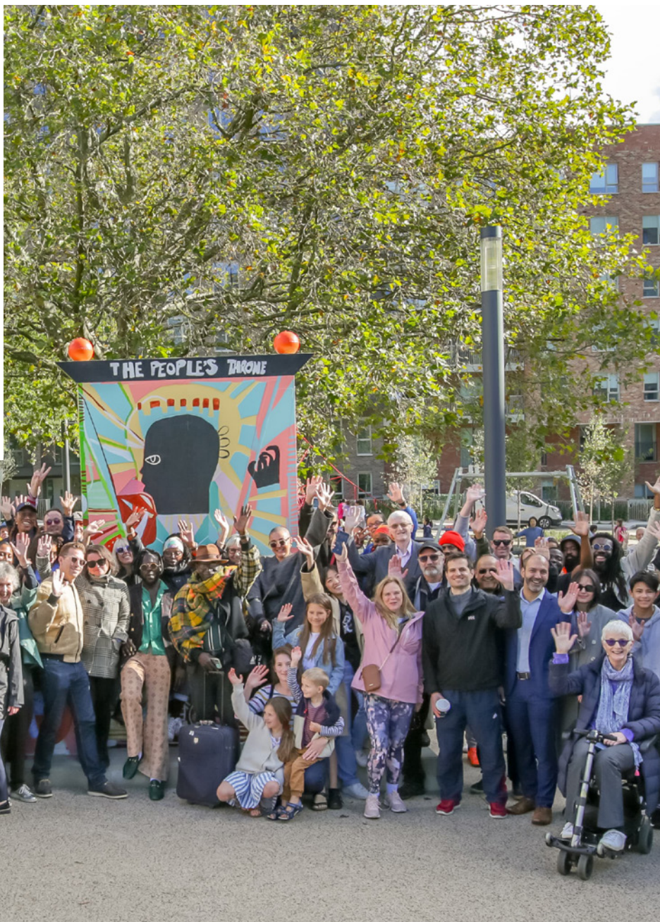
The People's Throne unveiling

Residents were also invited to join in various workshops that took place across the day.