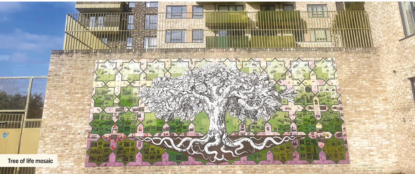
Tree of life mosaic

Welcome to the 42nd edition of the Acton Gardens newsletter. Here you'll find updates to keep you involved and informed throughout the regeneration of South Acton.